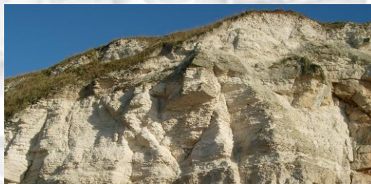
Chalk in Hunstanton Cliff, Norfolk