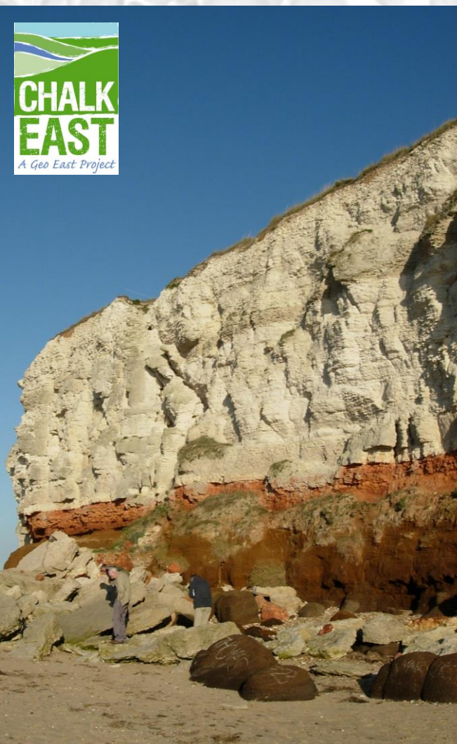
Hunstanton Cliff, Norfolk

Explore the Chalk landscape of Bedfordshire, Cambridgeshire, Essex, Hertfordshire, Norfolk and Suffolk